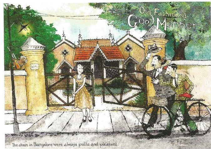
The chaps in Bangalore were always polite and pleasant.